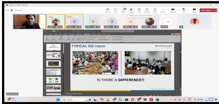
Batch 1: 27-10-2024, 4:00 PM – 6:00 PM